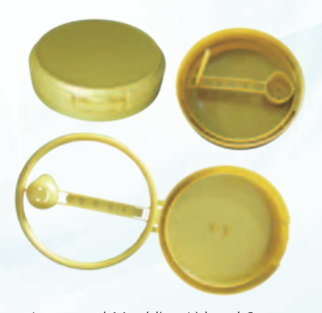
Integrated Moulding Lid and Spoon 一體成型的翻蓋和勺

在回顧年度內,塑料制品及加工業務未能完成年度預算,主要是由於珠海生產基地在遭受颱風「天鴿」的嚴重破壞,帶來一定的非營幣,然而珠海生產基地借此契機,然而珠海生產基地借此契機,對所有生產車間按更高級別的潔淨更新購置。 的高效率高配置的機器設備,提升整個生產的效率及產出。該基地在停產客戶的實工,新產之,與一人一體成型新技術的使用,縮短生產週期同時,更提供便捷的使用體驗給予消費者。