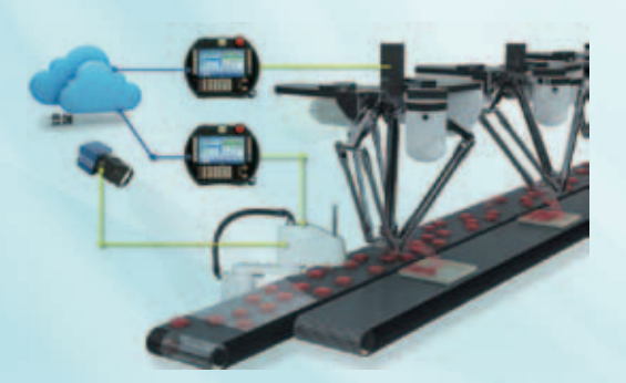
Intelligent Hi-speed Manufacturing Control System (Cloud Technology Interface equipped) 智能高速生產控制系統(具備雲端接口)