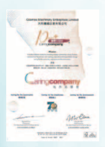
Awarded the Caring Company Logo for the tenth consecutive year 連續第十年獲頒發「商界展關懷」標誌