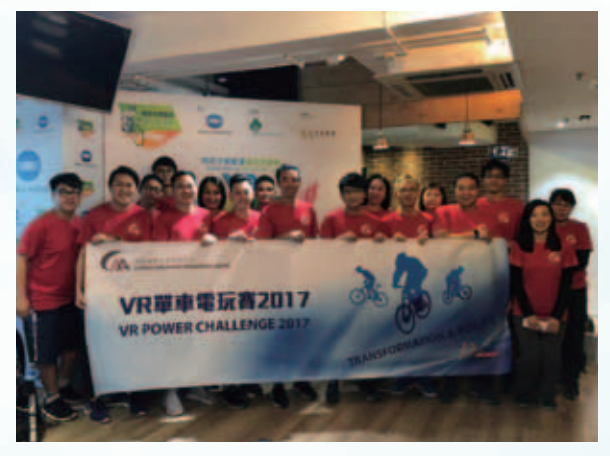
Participation in the "VR Power Challenge" 參加「VR單車電玩賽」