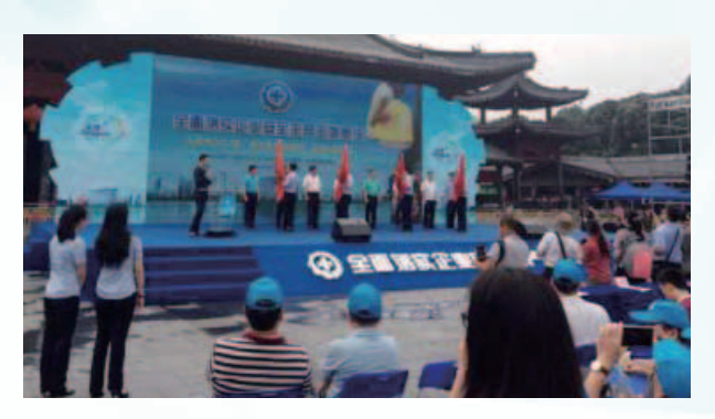
2017 Dongguan Safety Production Engagement Day 2017年東莞市安全生產諮詢日