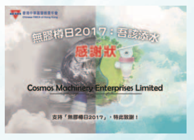
"No Plastic Bottle Day" 「無膠樽日」