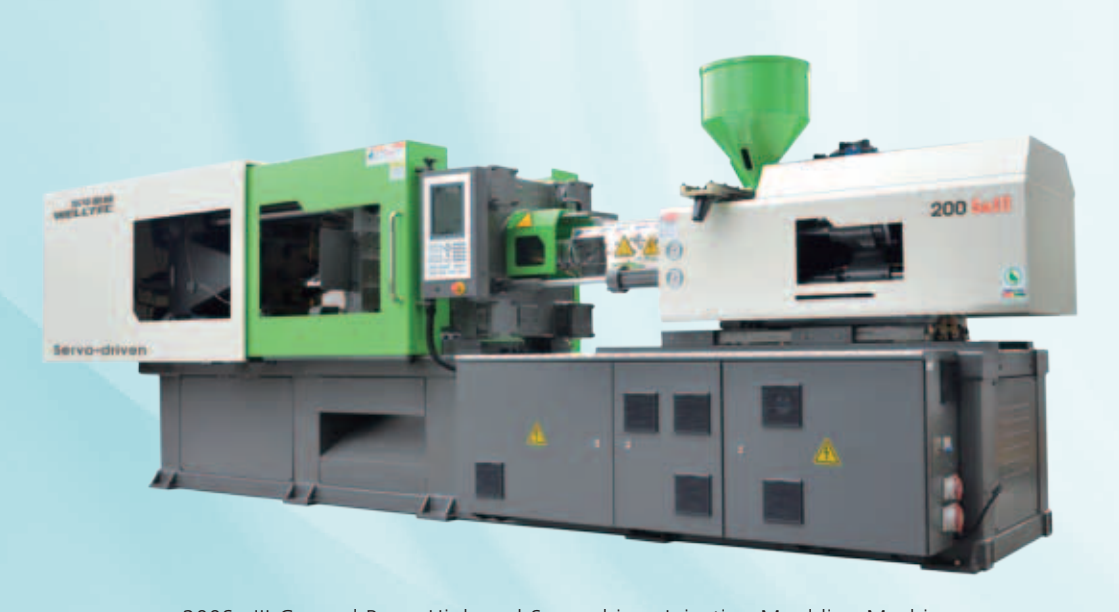
200Se III General Purse High-end Servo-driven Injection Moulding Machine 200Se III 通用型高端伺服注塑機

In 2017, the plastic injection moulding machine business strengthened its product development and optimisation. In particular, through the capability optimisation of two-platen injection moulding machines product series, its efficiency, speed and reliability have been significantly enhanced. This meets the demand of two major industries - auto parts and household electrical appliances and this business became the sales growth driver in the past year. In addition, sales of injection molding machines tailor-made for specific industries also recorded significant growth during the year, despite the fact that further enhancement needed to be made in areas such as the quality and cost of the machines, which is also the main focus for product development in the coming year. The successful implementation of the "Smart Industry 4.0 Solution" also provided a platform for the development of smart products. In the future, the Group will continue to strengthen product research and development to meet the market demands of various industries, so as to develop our products in series towards a professional and smart direction.